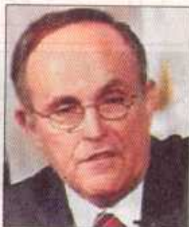
RUDY GIULIANI Ex-mayor of New York City